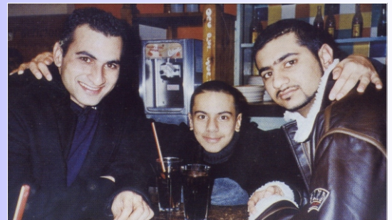
Brothers in ARMs